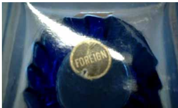
Abb. 2005-1/338 eBay England, Art.Nr. 3780784232, €90,20 „Walther & Sohne 1930's Art Deco Blue Glass 'Greta' Vase ... August Walther & Söhne in the 1930's ... 'Greta Pattern' ... featured in their 1936 product catalogue (see picture below) ...“, H 16,5 cm, L 20 cm, B 10 cm