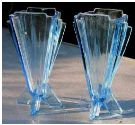
Abb. 2005-1/339 eBay Deutschland, Art.Nr. 6510326960, €20,50 „Art Deco Vasen mit 3 Füßen ... zart blau ... kleiner originaler Aufkleber aus Papier "foreign"“, H 22 cm, D 10 cm SG: Hersteller unbekannt, ähnlich Bagley, UK, um 1934, Dekor „Grantham“, aber anderer Sockel!