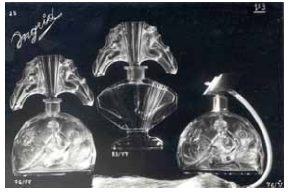
Abb. 2001-03/703 Catalogue pictures Schlevogt 1939, No. 1, Flakon „Fische“ mit Stopfen „Kniende Nackte“ 13/14, opakes Glas, Ingrid collection Ingrid Schlevogt