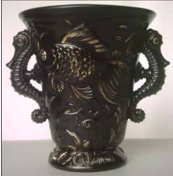
Abb. 2006-2/166 (neue Bilder) „A pair of very rare Barolac vases in opaque black glass decorated with gilding. Acid etched mark 'Tchecoslovaquie' to underside of footrim. Purchased from France and presumably imported by Markhbeinn, c.1934.“ opak-schwarzes Pressglas mit Vergoldung, H 17 cm, D 15 cm s. MB Glassexport "BAROLAC" 1949/1952, Tafel B4, Nr. 11422 Sammlung Bateman http://glassgallery.yobunny.org.uk/displayimage.php?album=57&pos=2