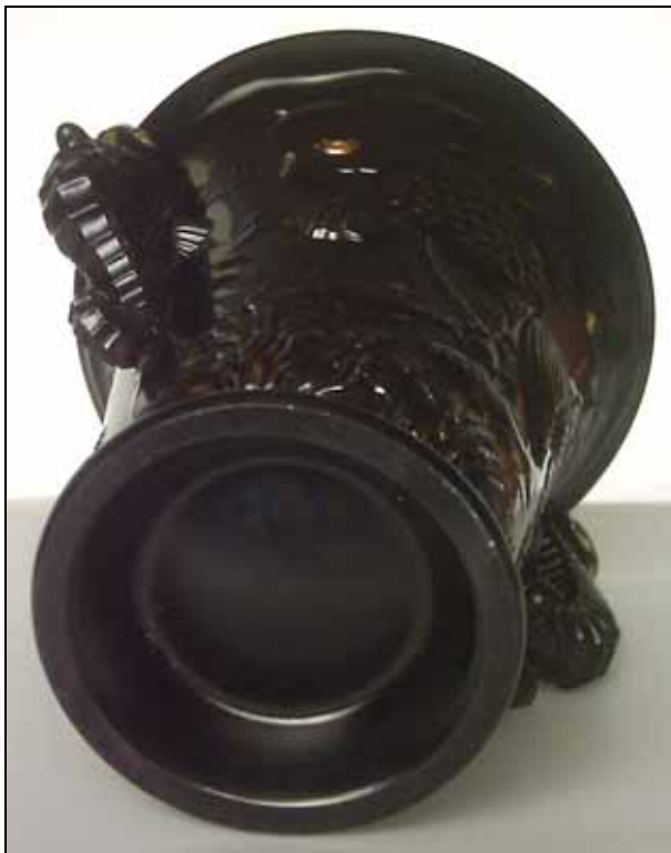
Abb. 2006-2/167 (neue Bilder) "Barolac Seahorse Vase, Moulded Signature to Base" opalisierendes farbloses Pressglas, H 17 cm, D 15 cm s. MB Glassexport "BAROLAC" 1949/1952, Tafel B4, Nr. 11422 Sammlung Bateman http://glassgallery.yobunny.org.uk/displayimage.php?album=57&pos=1