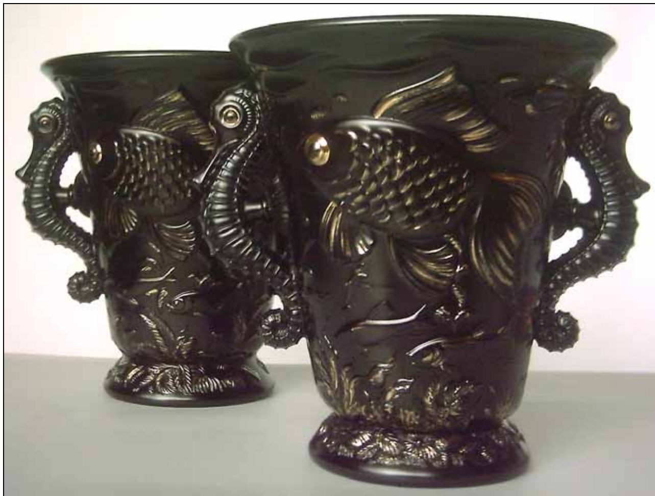
Abb. 2006-2/166 (neue Bilder)

„A pair of very rare Barolac vases in opaque black glass decorated with gilding. Acid etched mark 'Tchecoslovaquie' to underside of footrim. Purchased from France and presumably imported by Markhbeinn, c.1934.“