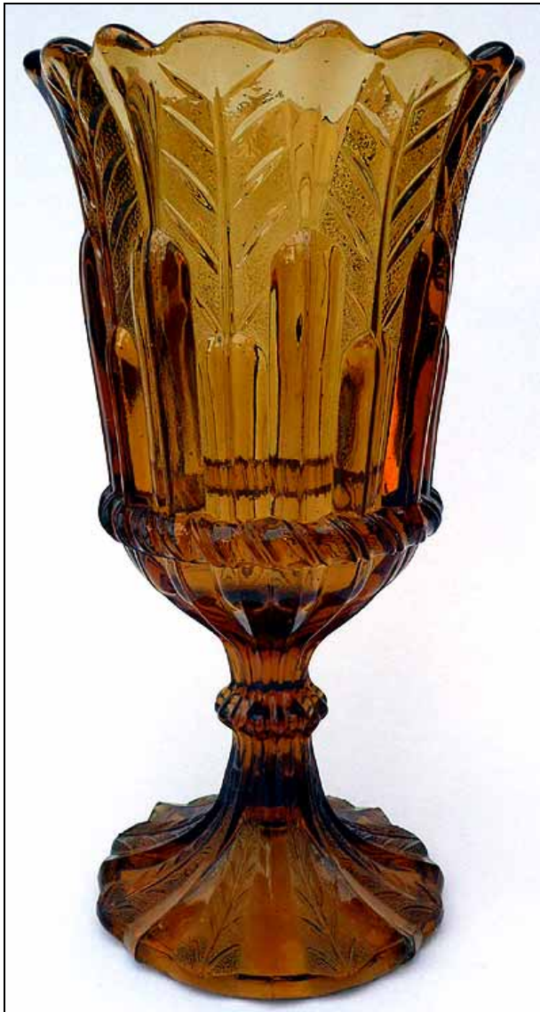
Abb. 2008-4/260 Fußbecher / Vase mit Blätter-Dekor bernstein-farbiges Pressglas, H 25 cm, D 13 cm Sammlung Zeh PK 2008-4, SG: Hersteller unbekannt, England?, um 1930 PK 2009-2, Zeh: England, um 1890, s. Notley, Popular Glass ..., 2000, S. 15

SG: Die Bücher von Raymond Notley sind in England noch im Handel - zu finden mit GOOGLE und AMAZON.co.uk.