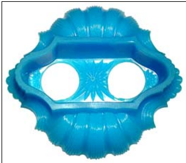
Abb. 2013-1/58-01 "French Ink" Desk Set, L: 7 5/16" [ca. 18,5 cm] France, c. 1875 NBMOG Collection Gift: Richard & Lesley Harris Acc. 2008.003 (A-D)

About 1878 the Boston & Sandwich Glass Company published a trade catalog illustrating almost 2.000 items available for purchase. Among the items was a shell-shaped, pressed glass desk set consisting of a tray and two bottles . One bottle held ink and the other held a fine blotting sand that was sprinkled over the freshly written page to keep the ink from smearing. Curiously, the price list description for the set reads „ French Ink .“ It sold for $12.00 per dozen.