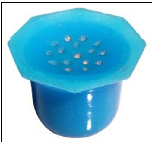
Abb. 2013-1/58-02 "French Ink" Desk Set, L: 7 5/16" [ca. 18,5 cm] France, c. 1875 NBMOG Collection Gift: Richard & Lesley Harris Acc. 2008.003 (A-D)

Design influences traveled both ways across the Atlantic during the 19th century. The German porcelain factory Meissen copied pressed Sandwich glass designs in the 1830s , as documented by the insightful article " Meissen Porcelain Designed from Glass Patterns ", by Joachim Kunze , reprinted in The Glass Club Bulletin of the National Early American Glass Club (Issue 153, Fall 1987, pp. 3-7). Sandwich, for its part, obligingly indicated the foreign origin of their desk set design when they described it as a "French Ink". The study of surviving examples and excavated shards has deepened our understanding of these trans-Atlantic relationships, and to that study the discovery of the NBMOG desk set brings surprising and welcome new evidence.