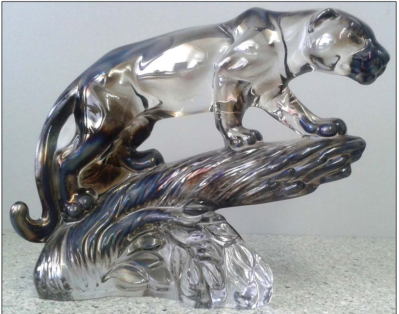
Abb. 2014-3/16-01 (Maßstab ca. 90 %) Panther on a tree trunk with leaves, smoke-grey glass, H 14 cm, L 17 cm, signature „PH“ collection Rýgl maker unknown, Czechoslovakia?, 1950ies?